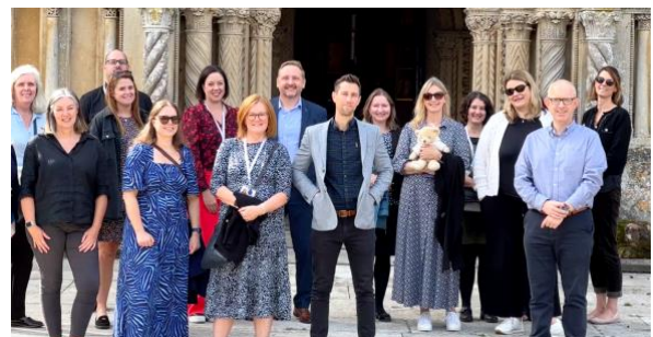
DSAT SERVICES TEAM